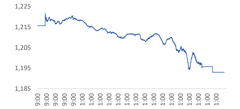
Figure 3 Proprietary trading