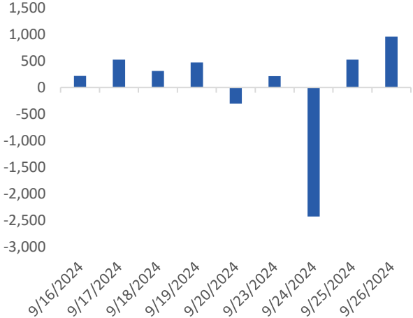
Figure 2 Foreign transactions