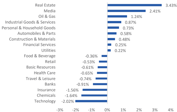
Figure 1 Sectors performance