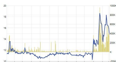
Chart (1 year)